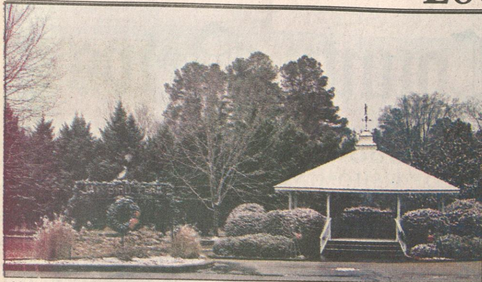
The beautiful gazebo in Jay Bird Park in Iuka is a "picture" any season of the year; but Monday morning after the snowfall, it was a winter wonderland.