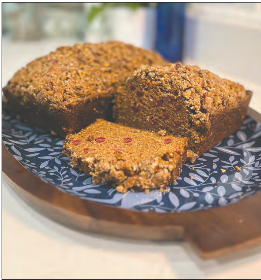
Pumpkin-Cranberry Quick Bread makes two loaves, so you have one to share with someone who needs a hug.