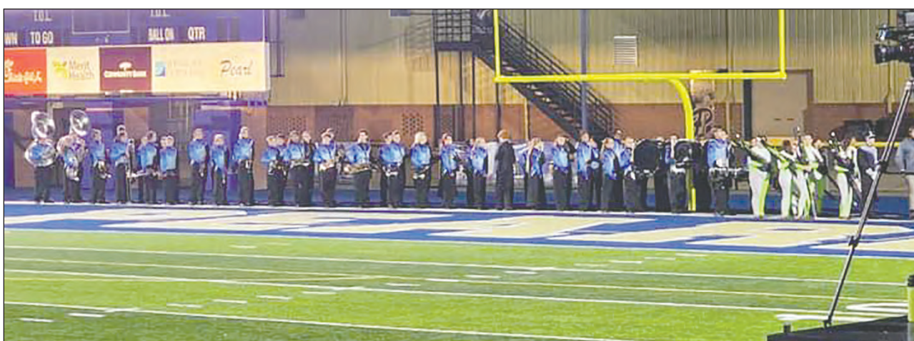
TC's Pride of the Tribe lines up for their performance at Pearl High School last Saturday night. Many more photos of this event online at www.tishco.news .