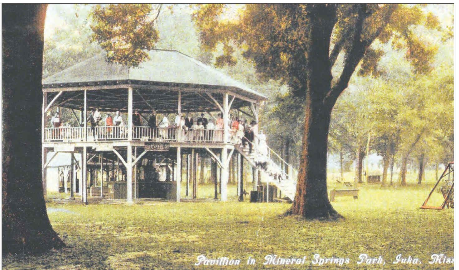
Pavilion in Mineral Springs Park, Iuka, Miss