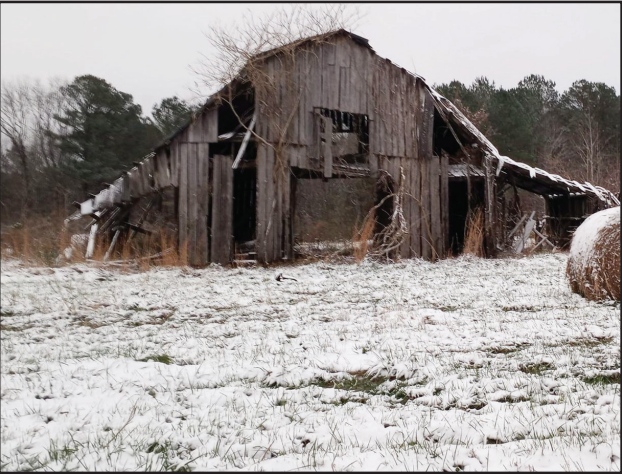
Has weathered many storms!