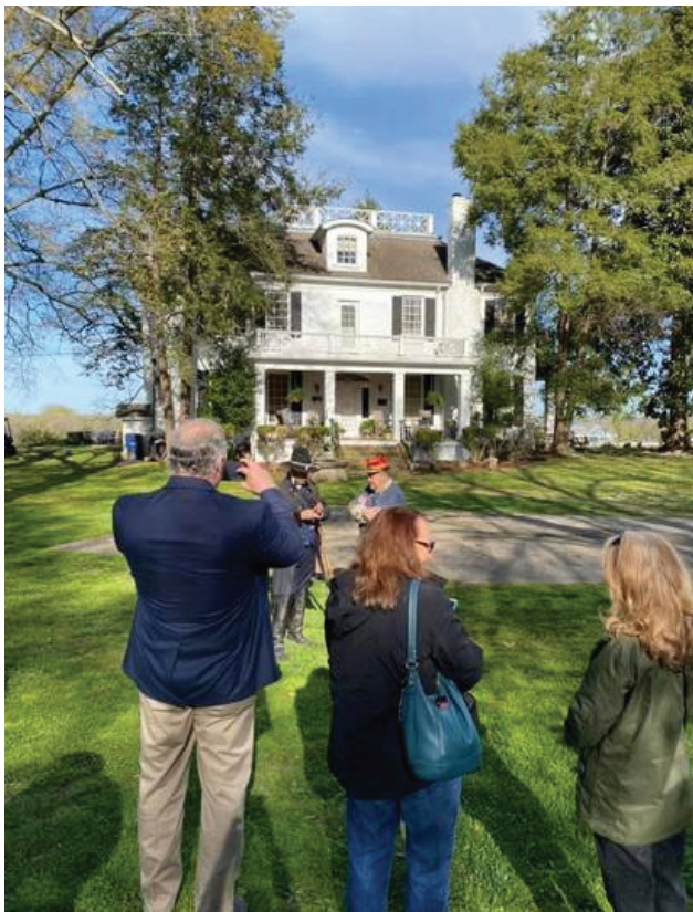
The Cherry Mansion in Savannah, TN.

History comes alive in Hardin County, Tennessee on the banks of the Tennessee River. Ten days packed full of living history, storytelling, hiking, cannon firing, plus biscuits and the trimmings!