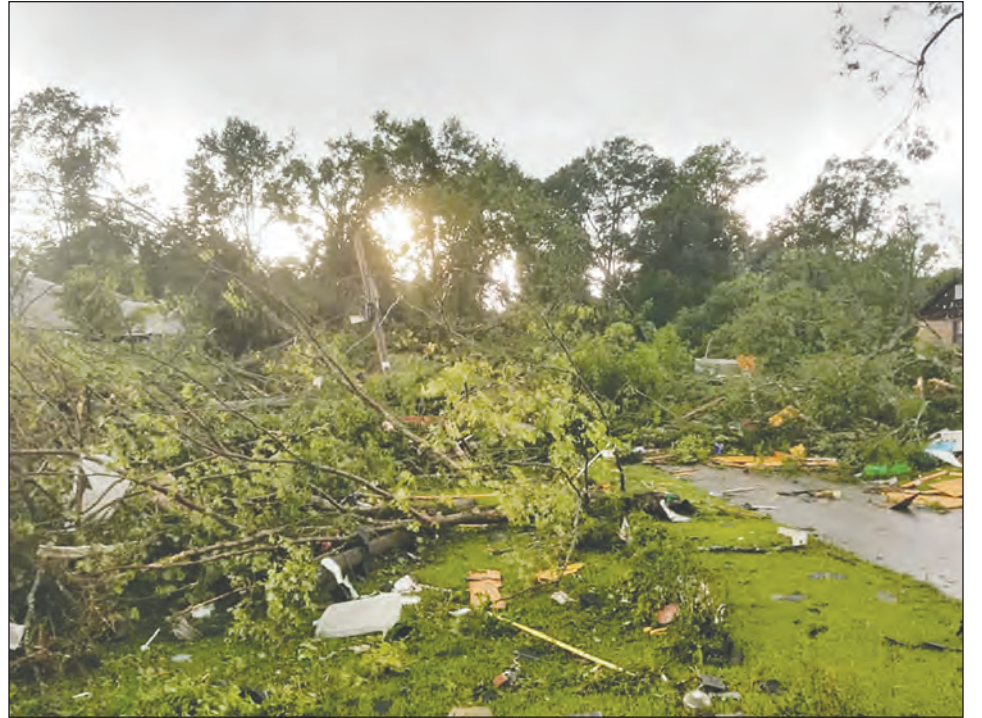
The storm blew a huge hole in the back of Nick Phillips’s law office, above left, littering the alley with hundreds of old bricks, above. Below, devastation to vegetation and trees changed the entire neighborhood skyline.

Be sure to look online ( www.tishco.news ) at the e-editions from last year for more coverage and slideshows of images from that time.