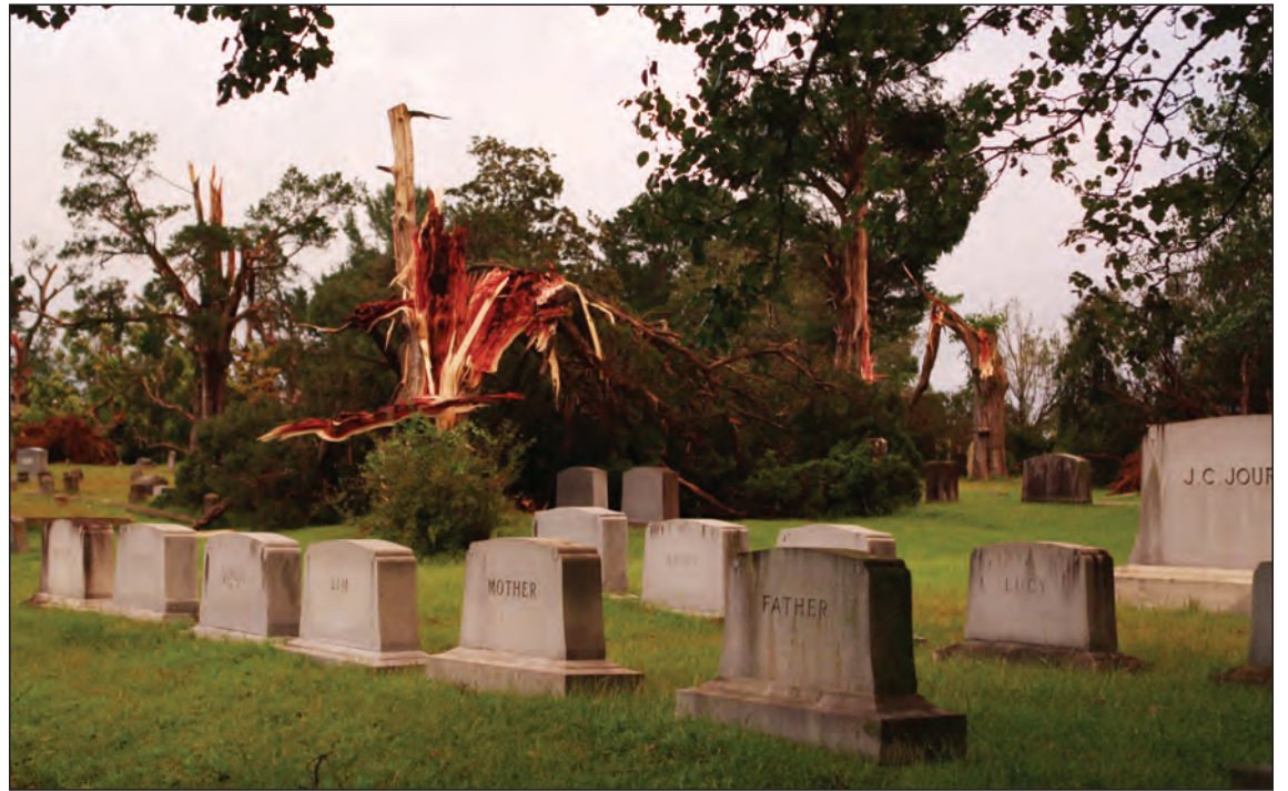
Tornado damage - Decades-old trees snapped by tornado winds in historic Oak Grove Cemetery. Below, the shop window at Uncle Shirley's Antiques was just some of the damage to downtown Iuka buildings.

Trees in her yard were uprooted and fell on the house, causing complete destruction. She was unable to escape!