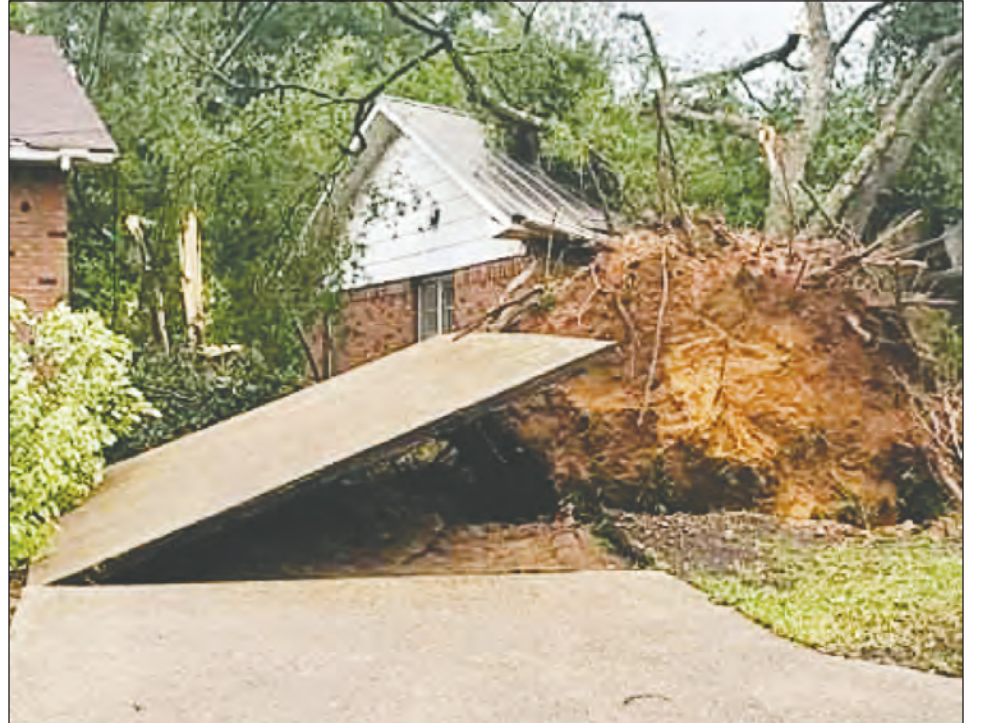
Uprooted trees lifted this entire section of concrete driveway.