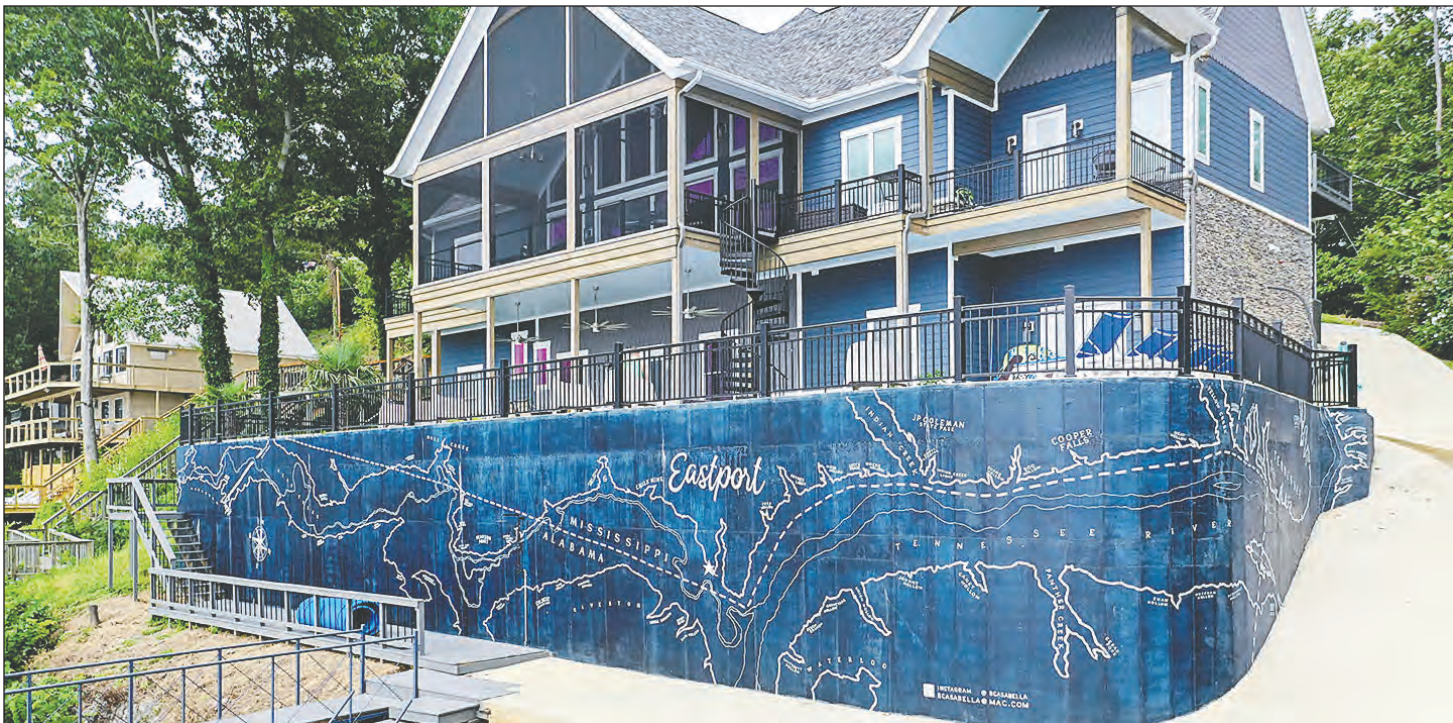
Putting Eastport on the map - Brian Casabella's genius-level mural of Pickwick Lake on a retaining wall at Eastport.