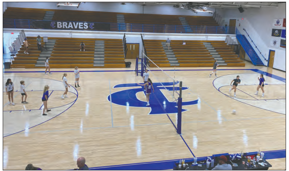
Tishomingo County's new gym floor before a recent volleyball match.

The Chieftains travel to Alcorn Central on Sept. 6 for a football game. Progress reports go out on Thursday, Sept. 8.