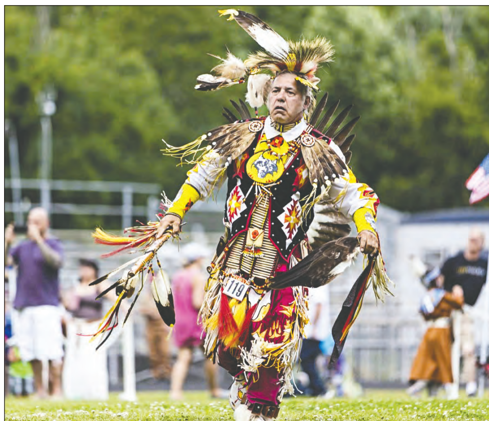
Above, Cherokee Nation’s Deer Clan Productions will present ceremonial dances in Mineral Springs Park at 11 a.m. and 2 p.m.

evening from 7-11 featuring live bands and several food trucks. Tickets ($35) are available in advance for that fund-raising event. Proceeds will go toward the expenses of producing Heritage Day 2022, and future events. Get advance tickets from RX Solutions on Fulton Street Downtown, or at the Tishomingo County News downtown.