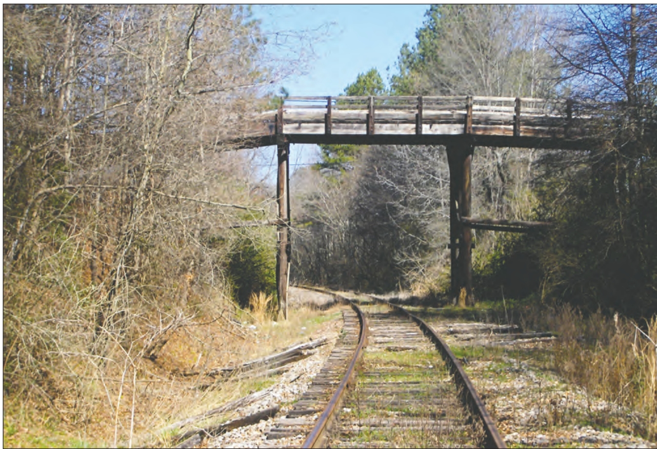
Railroad trestle bridge at Tishomingo. This one and another in Dennis were replaced with grade crossings in the last decade.