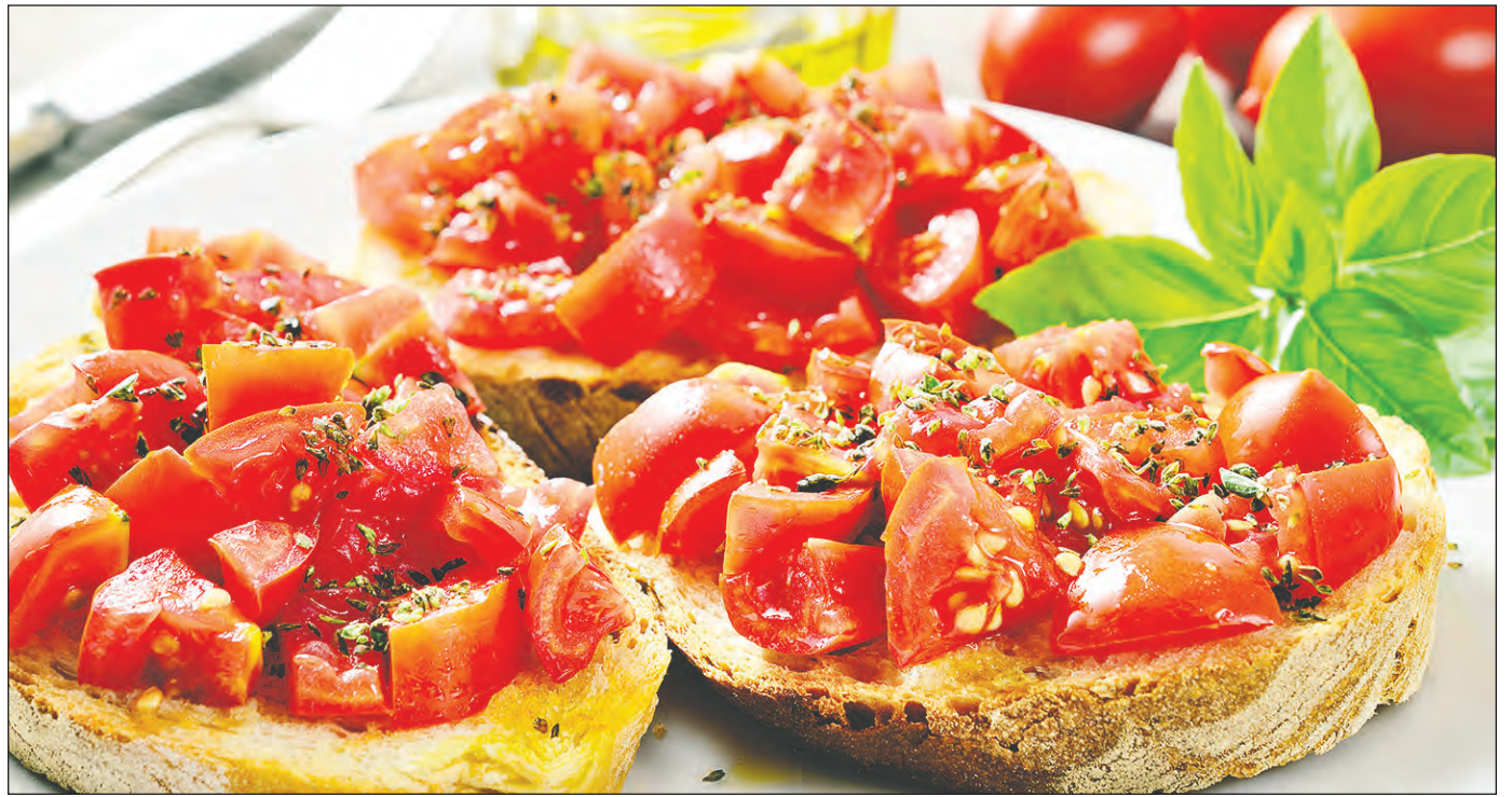
Bruschetta - Fresh tomatoes with a few simple ingredients and you have a restaurant-worthy appetizer or snack from your own kitchen.

Here you are Judy, free with your subscription: