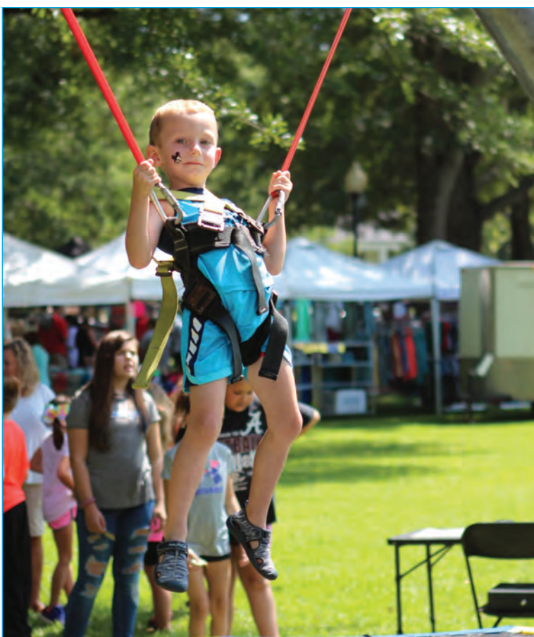
Children rides and activities will be in Mineral Springs Park all day.