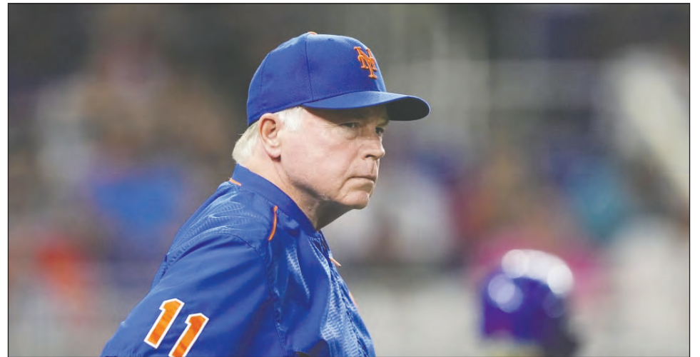
Mets manager Buck Showalter.